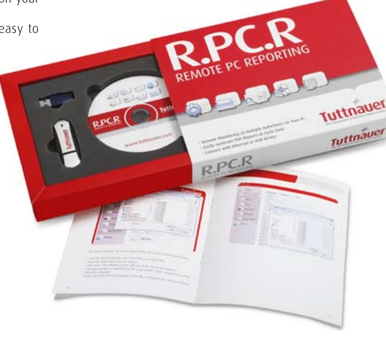
With R.PC.R you can see: Graphs of the cycle data, numeric cycle data, cycle print-outs, measured values table, table of parameters.