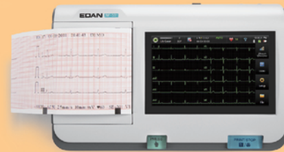
SE-301 3-Channel ECG