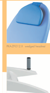
PKAZP012 X wedged headrest