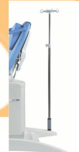
SIAZP003 Telescopic infusion stand