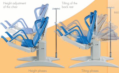
Height adjustment of the chair