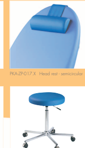
PKAZP017 X Head rest - semicircular