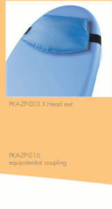
PKAZP003 X Head rest