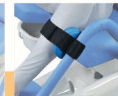
ZP-Z5 X Fixation strap (pair)