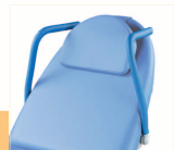
PKAZP008 X Side supports (pair)