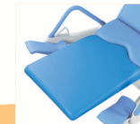
PKAZP001 X Foot rest - removable