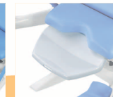
PKAZP005 Baby plate - removable