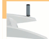
PKAZP004 Holder of infusion stand