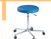
ZK05 X Doctor's mobile chair