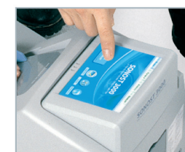
Touch screen color monitor